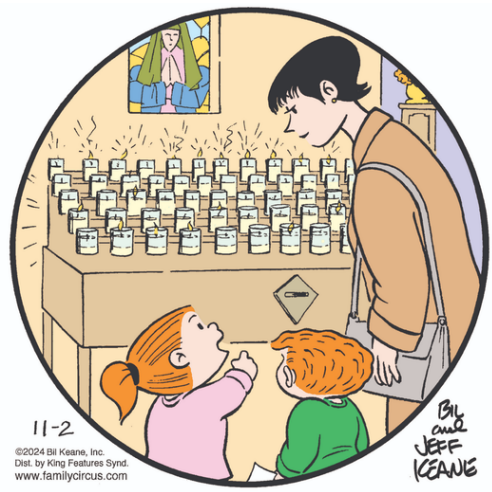
"If you blow out all the candles, do you get your prayers answered?"

The 2025 PAD forms are now available from the website and vestibule.