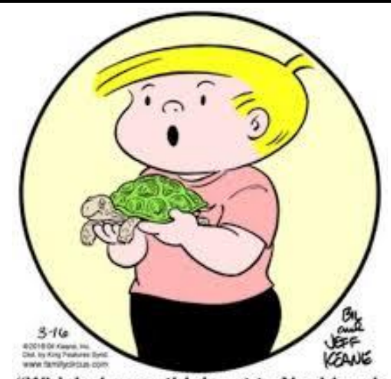
"Which do you think got to Noah's ark last — turtles or snails?"

More questions? Contact the Parish Office